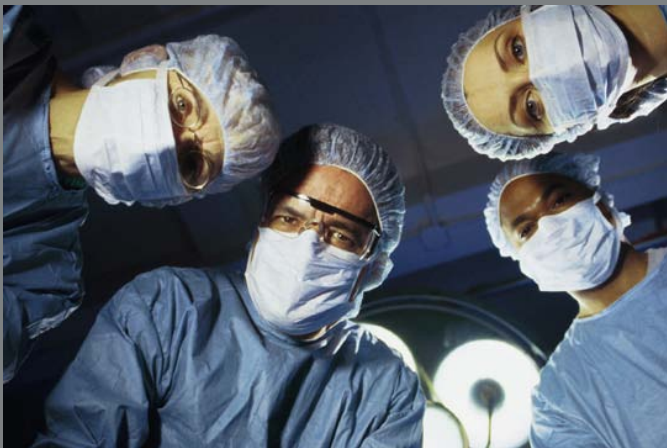
See "Early Intervention," page 2

Much of the medical and ergonomic research on Cumulative Trauma Disorders is focused on Medical Cost savings. However, we all know that without surgery, the lion's share of dollars for these claims is spent on disability. Why do seemingly innocuous injuries like Carpal Tunnel Syndrome wind up costing so much in indemnity? And more importantly, what can be done to prevent this cost?